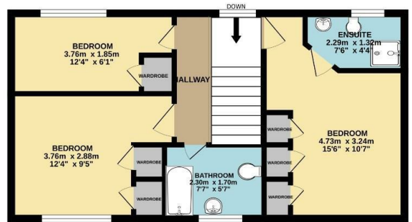
1ST FLOOR 42.9 sq.m. (462 sq.ft.) approx.